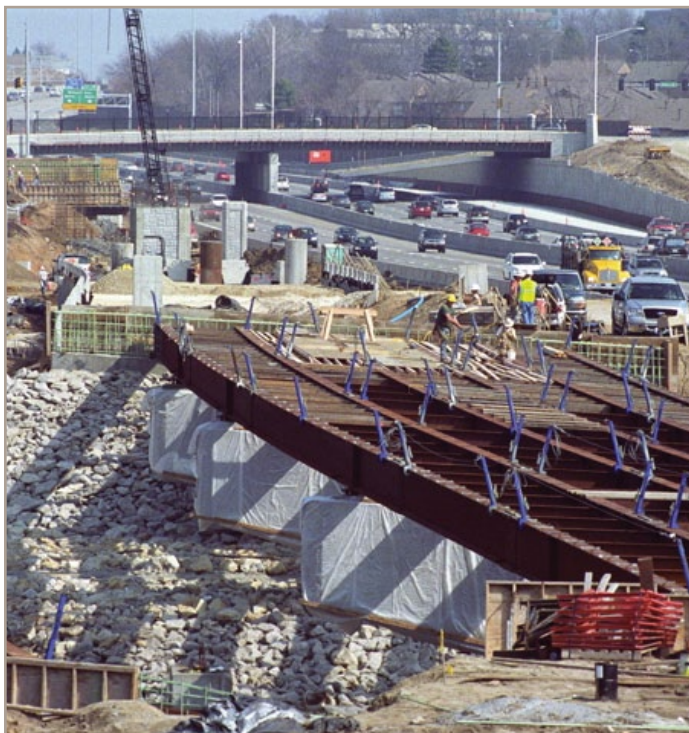
Important projects like U.S. 69 at 435 could be shelved if funds are raided from the T-WORKS budget again.

And on Feb. 11, 2011, our contractors received a big shot in the arm when Gov. Sam Brownback announced $115 million for much-needed improvements at the intersection of U.S. 69 and Interstate 435 in Overland Park. That money was part of $250 million in funds for road projects announced by the governor that day. Other projects included expansion of Kansas 18 in Riley County and U.S. 50 in Reno County. Those were to be among the first projects funded by T-WORKS, which is partly funded by the 1-cent sales tax increase that our Association fought hard for passage.