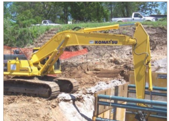
A Fahey track hoe gets down to business at Penn Valley Park.