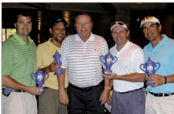
Clarkson Classic 2007 Afternoon Flight Winners